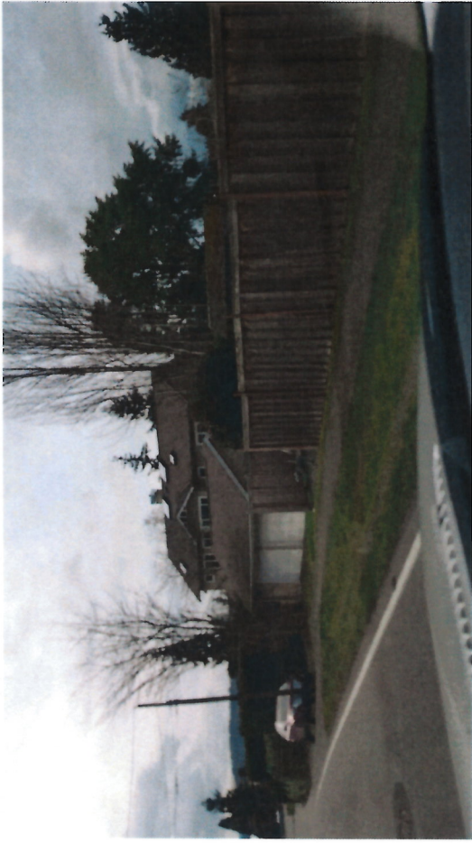
Similar height and location fences all along West Mercer Way