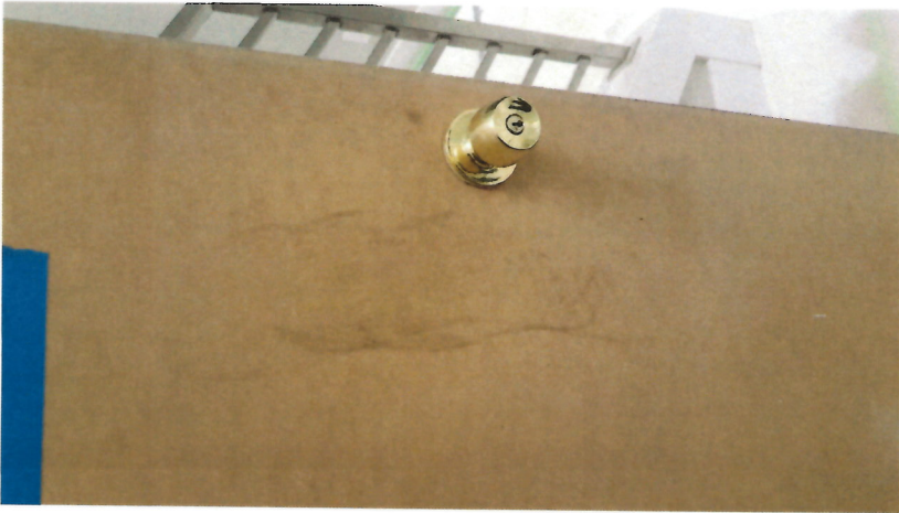
Clear footprint marking on the front door indicated forced entry