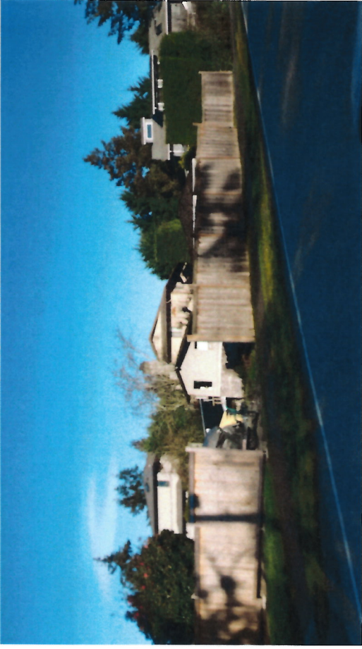
Similar height and location fences all along West Mercer Way