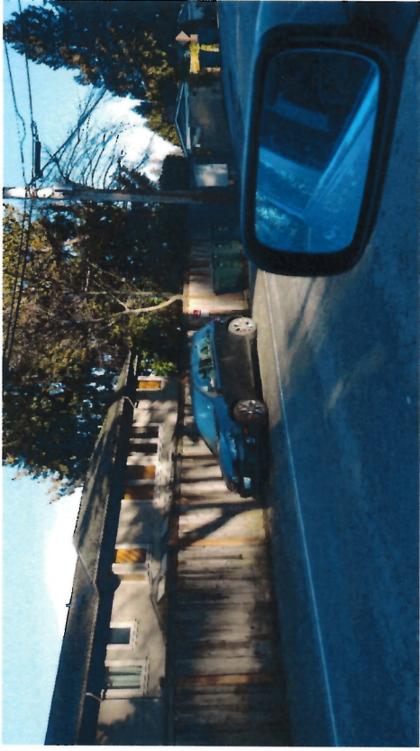
Similar height and location fences all along West Mercer Way