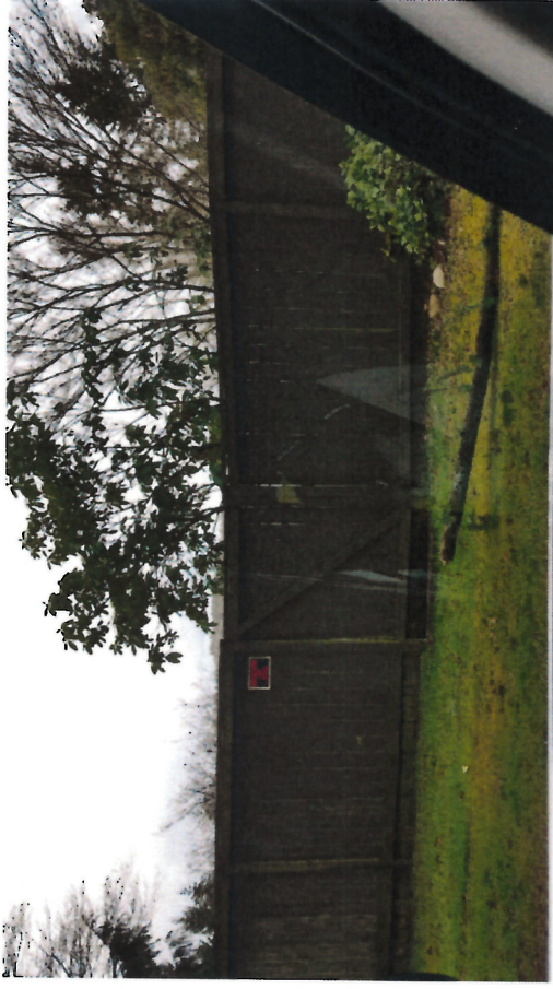
Similar height and location fences all along West Mercer Way