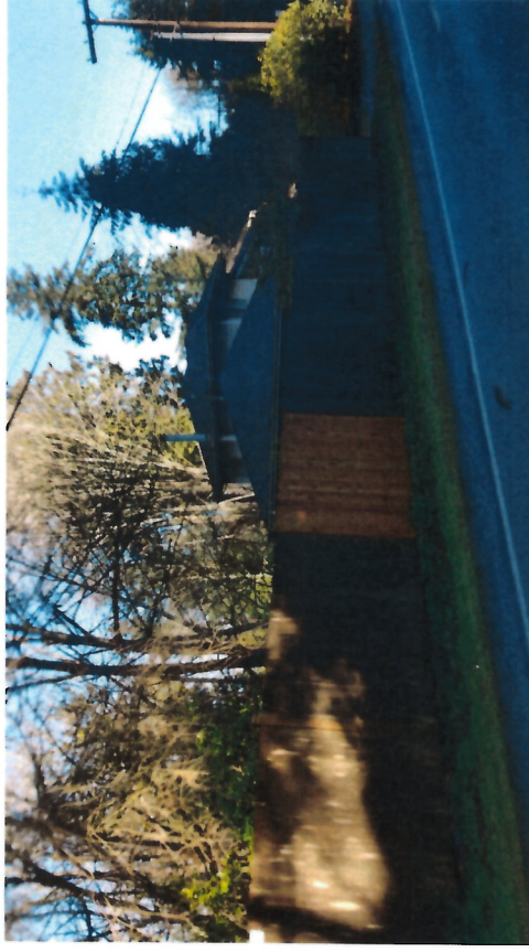
Similar height and location fences all along West Mercer Way