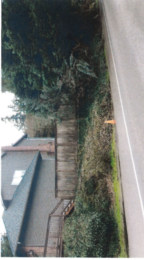
Similar height and location fences all along West Mercer Way