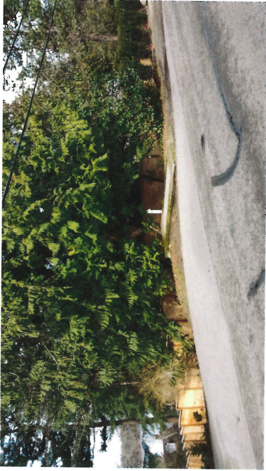
Recently approved fence and gate project of similar height and location (along West Mercer Way and an adjacent improved street) currently under construction three homes south of our property.