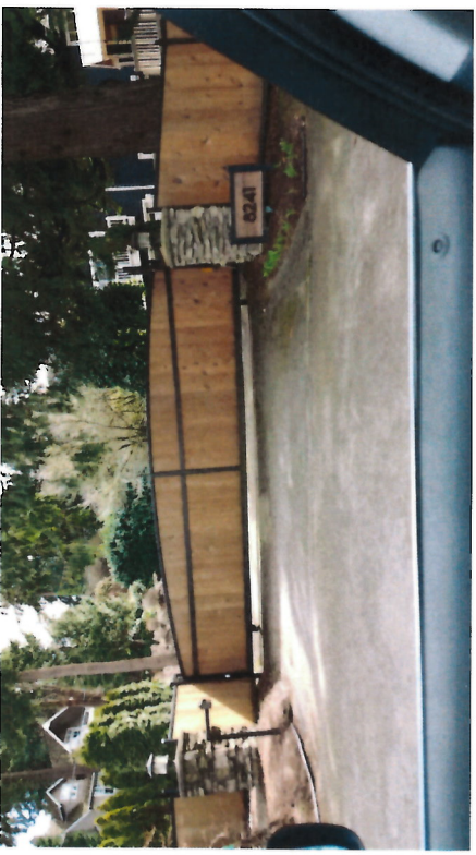
Similar height gates located on or just off of West Mercer Way