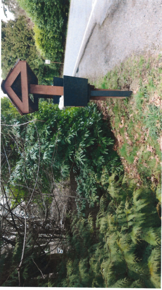
View looking north from the top of Eden Lane, where there is already an existing fence of similar height, located closer to West Mercer Way than our intended fence, gate, and planned vegetation.