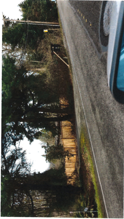
Existing fence of similar height and location (along West Mercer Way and an adjacent improved street) located on the Ellis property immediately south.