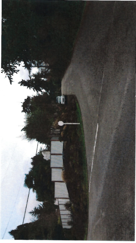
Similar height and location fences all along West Mercer Way