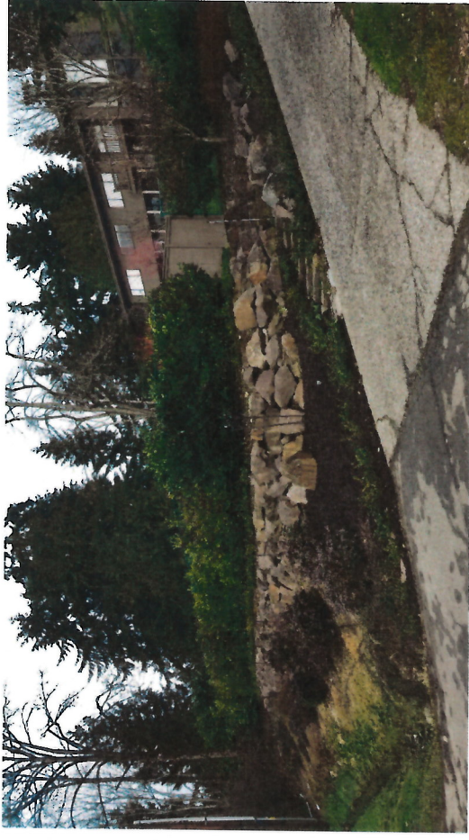
Existing fence of similar height and location (along West Mercer Way and an adjacent improved street) located on the property immediately north of Dr. Jack.