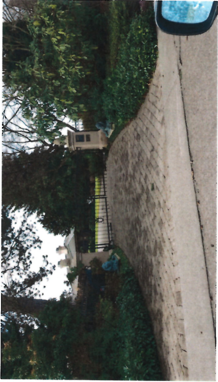
Similar height and location gates all along West Mercer Way